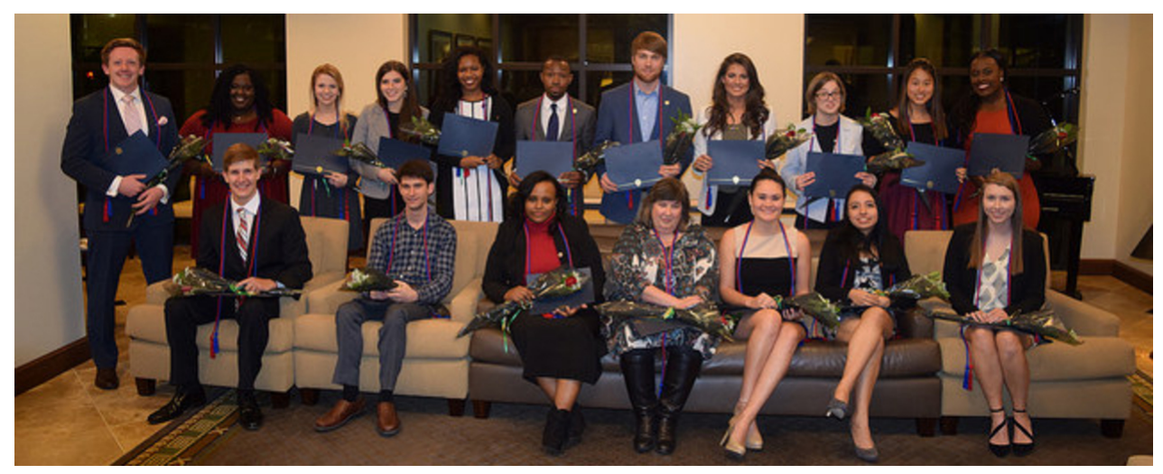
HCM Upsilon Phi Delta inductees