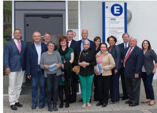
DSc students in Switzerland

This spring, second-year executive master's ( Master of Science in Health Administration - Executive Format ) and doctoral students ( Executive Doctor of Science Degree in Administration-Health Services ) traveled to Europe to study the healthcare systems in Ireland, Italy and Switzerland. Personal lectures and tours from local leaders highlighted the international experiences.