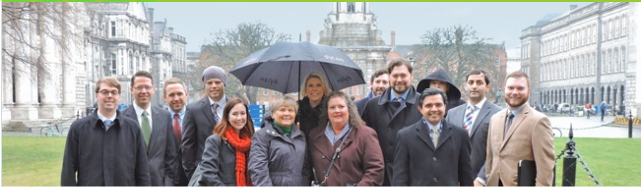
Executive MSHA students in Ireland