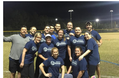
Parallon Business Performance Group kickball team