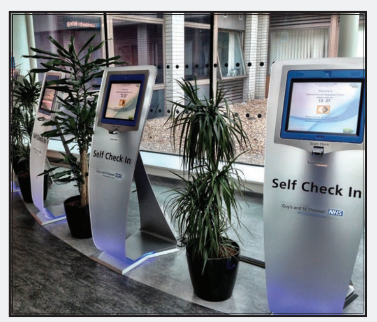
This electronic check-in system at Guy's and St. Thomas' outpatient clinic sparked a rich discussion. In addition to the check-in kiosks depicted here, the clinic uses electronic display boards to show whether each doctor's clinic appointments is running on schedule, early, or behind. When the doctor is ready to see a patient, her name is displayed, along with the room to which she is to report.