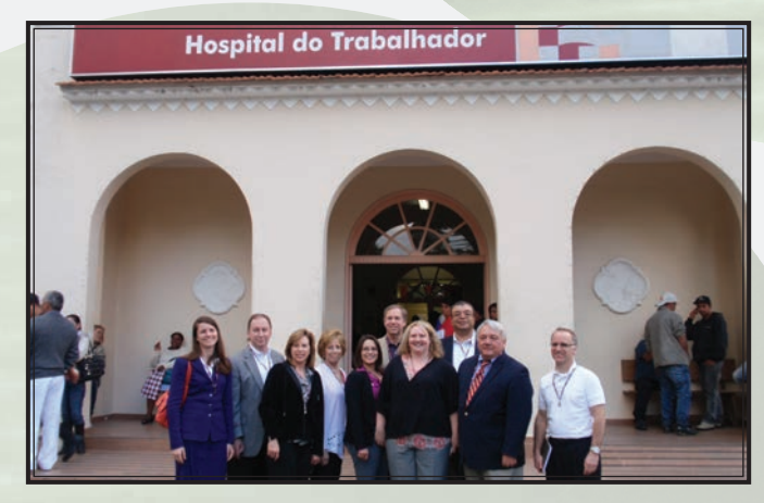
The group pauses for a quick photo after their last tour at Hospital do Trabalhador, a teaching hospital that specializes in trauma; occupational health; and maternal and child health. The hospital also houses a thirty-bed "pediatric sector" and Center for Integral Assistance of Cleft Lip and Palate.

This photo depicts a model of the Hospital Marcelino Champagnat (HMC), Curitiba's "gold standard" hospital. HMC is the only private hospital in a system that owns four other large public hospitals. HCM was built to cater exclusively to private patients, but the group was fascinated to learn that the facility's profits are used to subsidize the four other not-for-profit hospitals in the system.