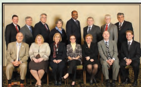
Faculty Advisers for Participating Teams

Make plans to attend next year's event on February 16, 2012 at the Wynfrey Hotel in Birmingham.