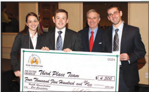
Third Place Team from UNC-Chapel Hill