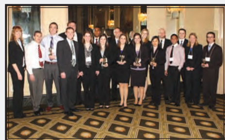
Honorable Mention Teams