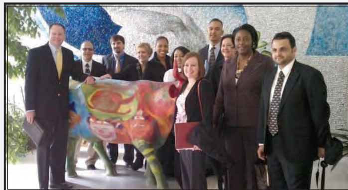
EMSHA Students in Prague

Europe, and enjoyed learning about its organizational structure and quality management initiatives during presentations by clinicians and administrators. The tour concluded with a visit to the FN Motol Emergency Department.