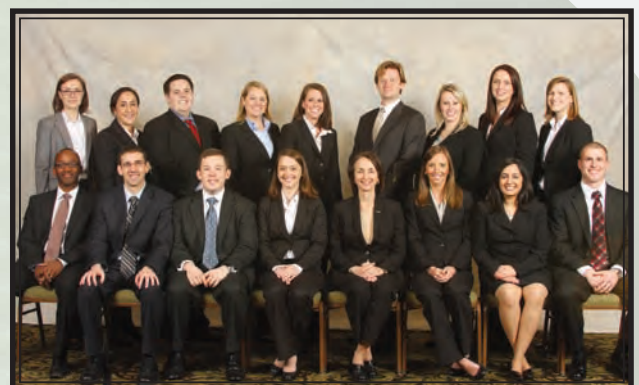
Six Finalist Teams