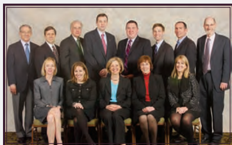
National Panel of Judges