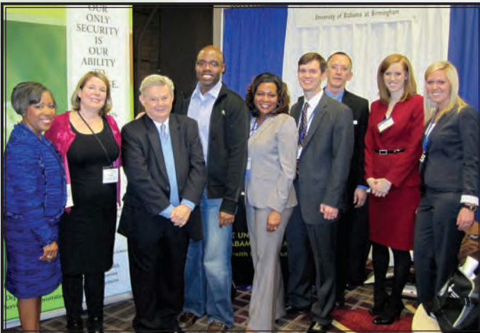
ALUMNI, FACULTY, AND CLASS 46 MEMBERS AT ACHE BOOTH