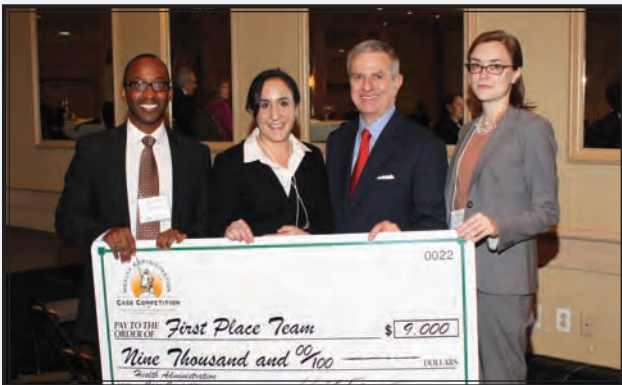
First Place Team from Baruch/Mt. Sinai College

This year’s Health Administration Case Competition was strengthened by the excellent teams representing schools from around the country as well as the national panel of judges: