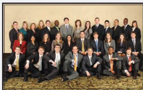
Case Competition Ambassadors