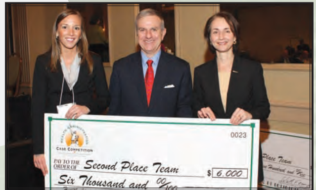
Second Place Team from University of Central Florida