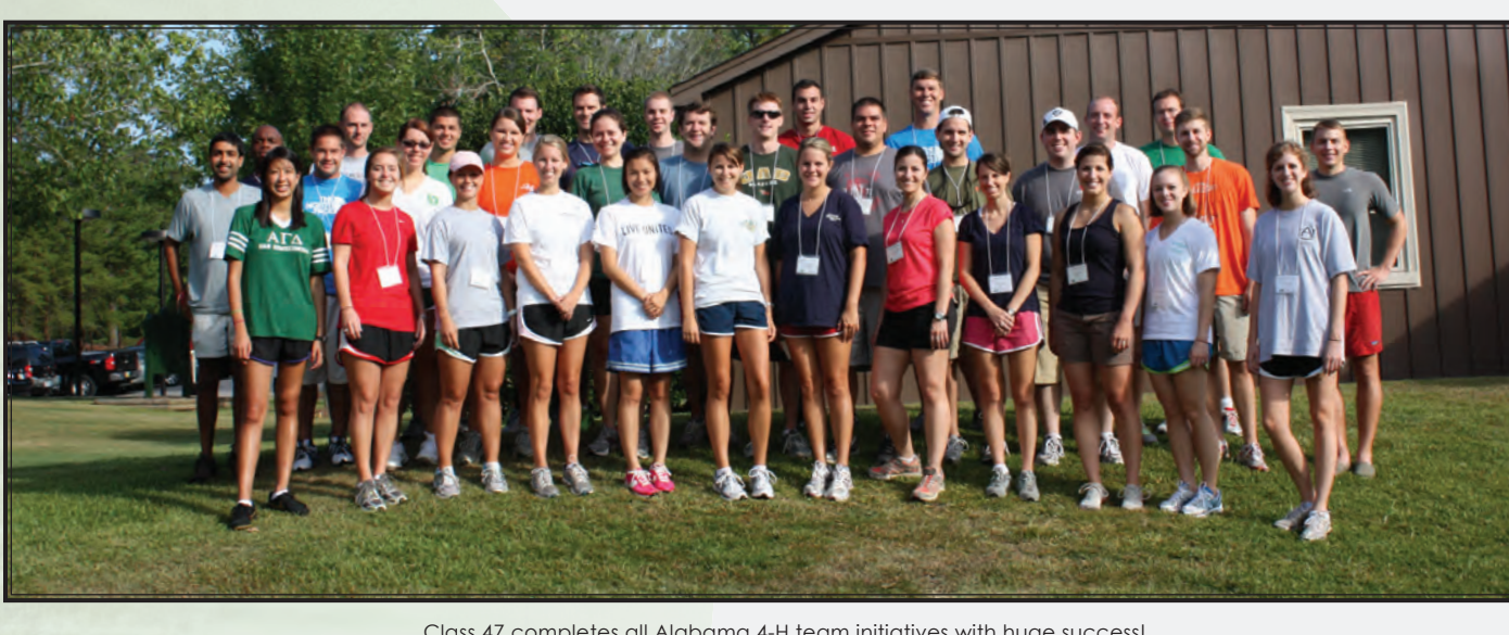
Class 47 completes all Alabama 4-H team initiatives with huge success!