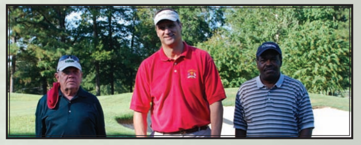
2nd Place Team