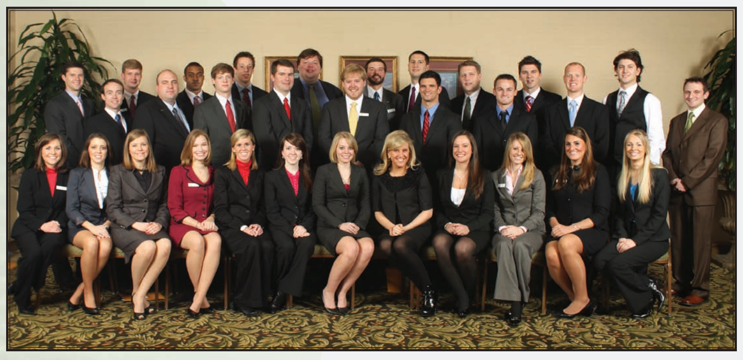
UAB MSHA Class 45 Ambassadors for Health Administration Case Competition