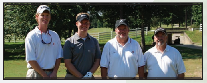
1st Place Team