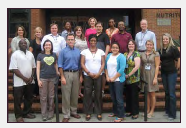
Members of F 46