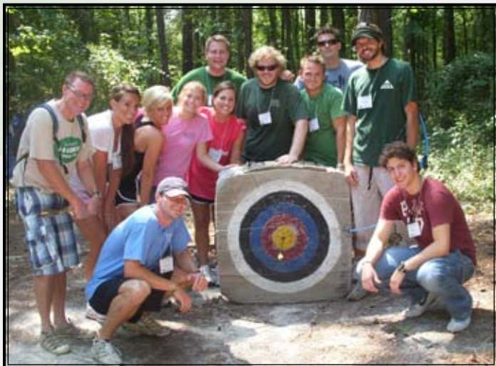
Team completes Amazing Race mission.