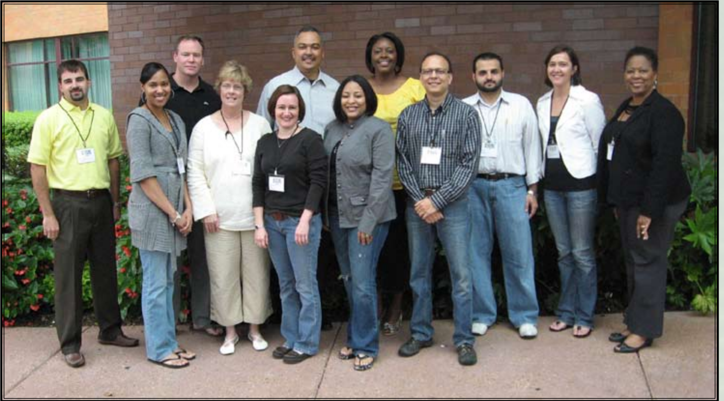
Members of E45