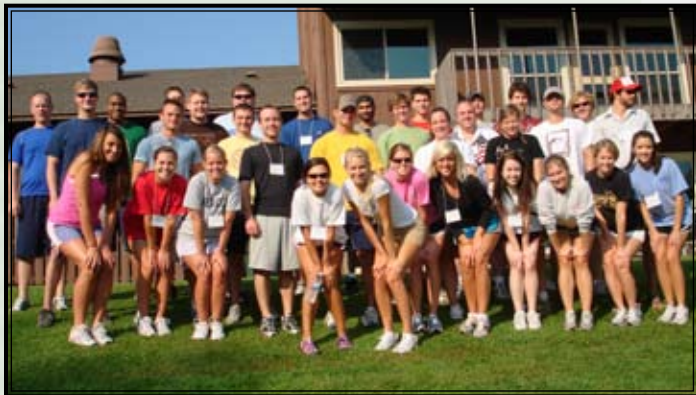
Class 45 at Orientation