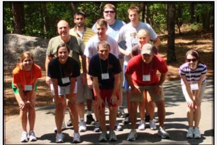
Building new friendships