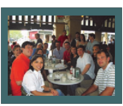
Above: Members of Class 42 at Café Du Monde.

Stay tuned for details for next year's reception that will be back in Chicago.