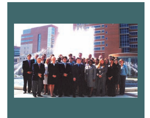
(Above): Members of MSHA Class 41.