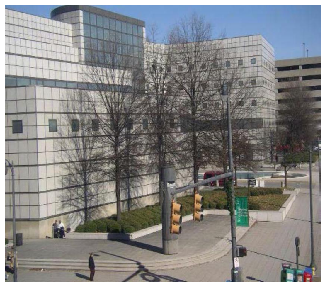
UAB Kirklin Clinic