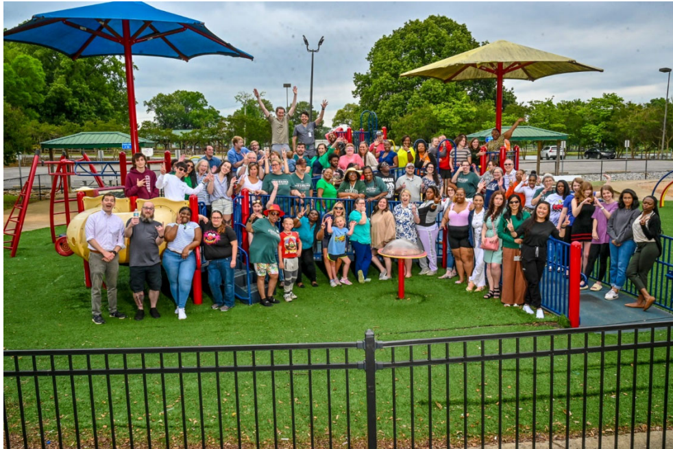
2023 Employee Picnic, the “not so serious” picture

commitment to the safety of the community. Following is a list of resources you can use to help create a safe campus for yourself and others.