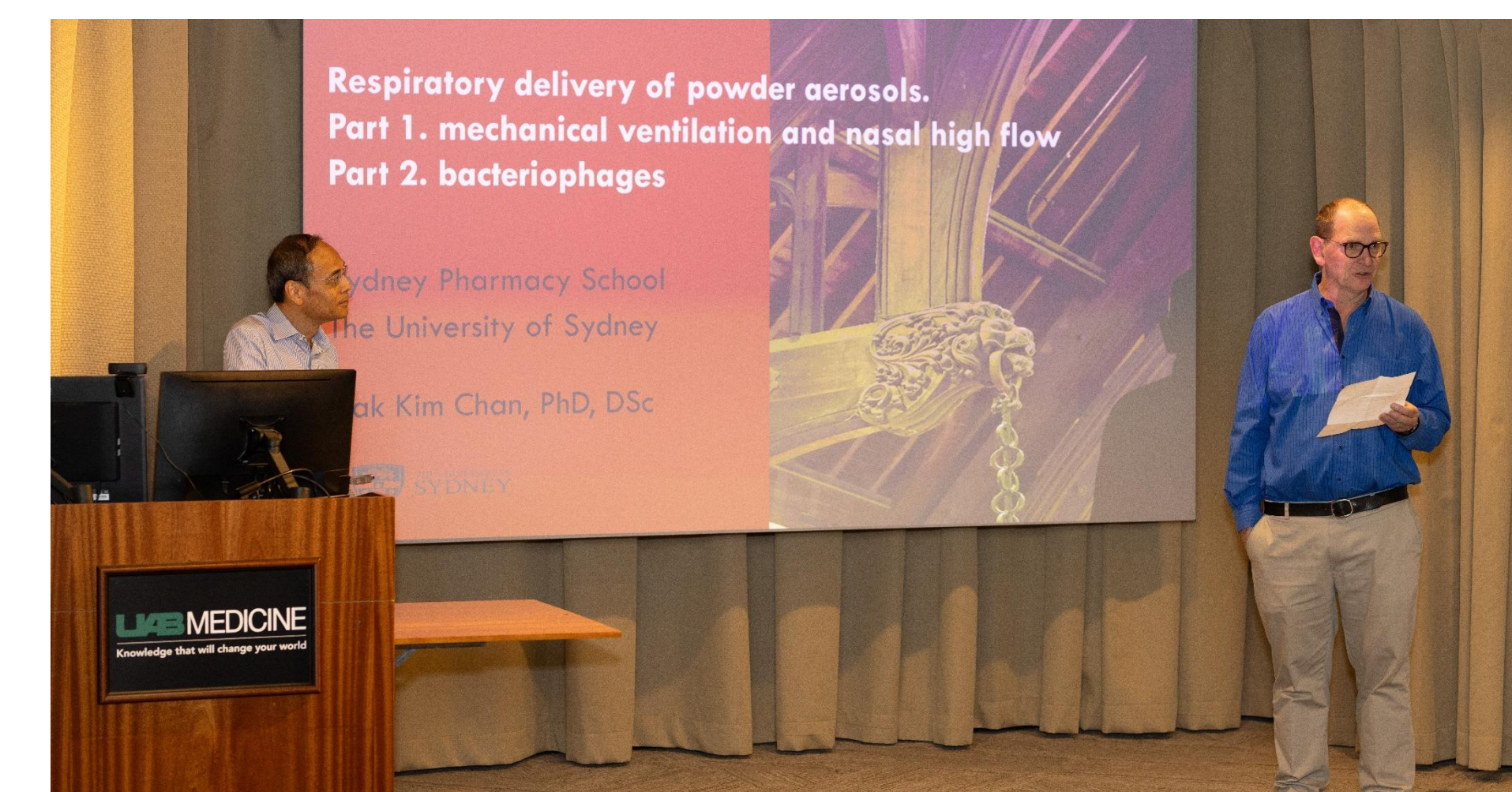
Pictured: Pulmonary Grand Rounds presentation