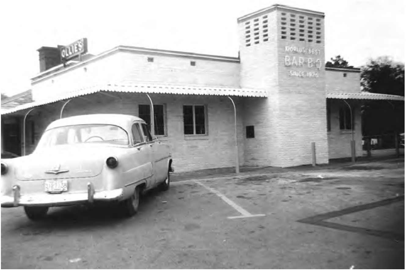
Figure 1. Ollie's Barbecue Restaurant as Located on 902 7th Avenue South, 1959, Source: © Birmingham, Alabama Public Library Archives.

Title II specifically targeted private businesses such as Ollie's. This section of the law provided for injunctive relief against instances of discrimination (based on race, color, religion, or national origin) in places of public accommodation that "affect commerce." The commerce provision implicitly asserted that the Commerce Clause of the U.S. Constitution gave Congress the authority to regulate discrimination in the private sector. Ollie's Barbecue, a private business that participated in commerce, held its